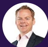
Eugène Gilbert Management Consulting

Take the time to review the structure of your cross-border operations. A well-thought-out reorganization could help you address the challenges posed by the global economic environment.